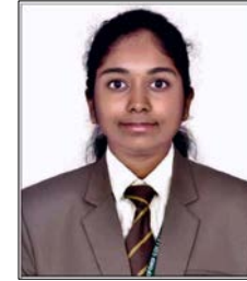
BM MONIKA 79.41