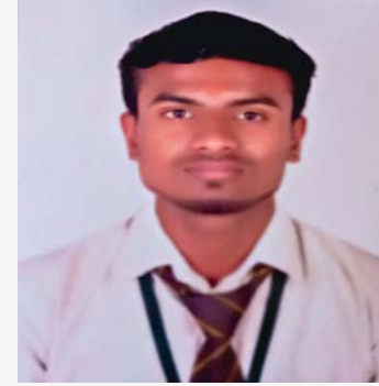
MITHUN N 82.0 %