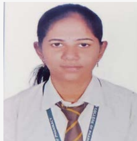
DRUTHI. C 76.92%