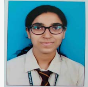
SAHALA K 79.2%