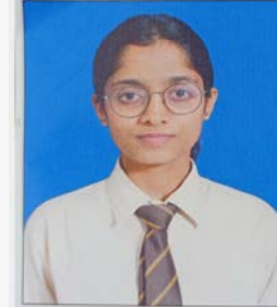
YASHASHWINI SM 80.15%