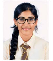
PAVANA M 78.96