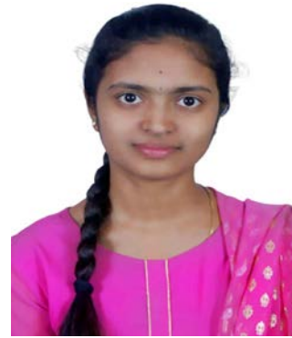
HAMSA .C 97.9 %