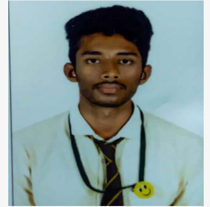
POVINDHAR C 77.67 %